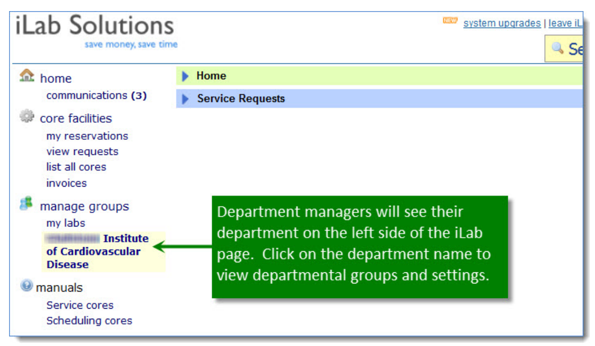
Figure 5. Department administrators will see the name of the department they belong to on the left side of the iLab page. Click on the department name to view groups under the department and manage settings.

When a department administrator logs in, you will see the name of the department you belong to on the left hand side of the iLab page.