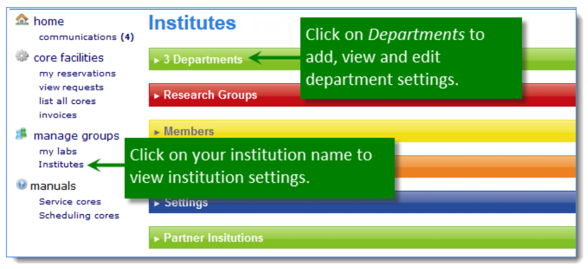
Figure 1. Institution administrators can add, view and edit departments within their institution on their institution settings page.